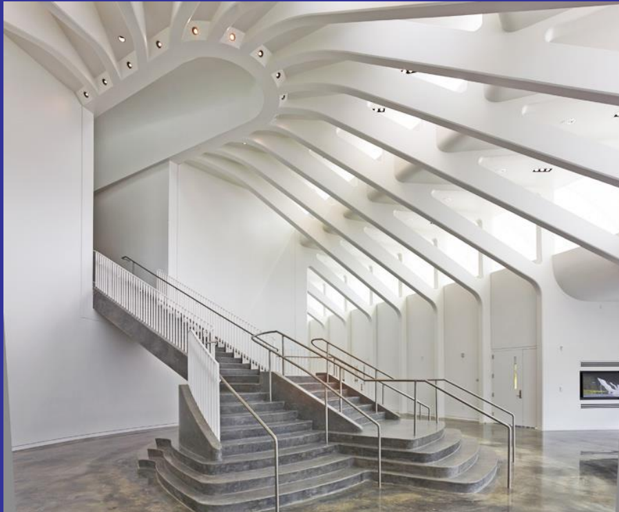
Florida Polytechnic University Lakeland , FL

Engineering News Records Global Project of the Year 2015