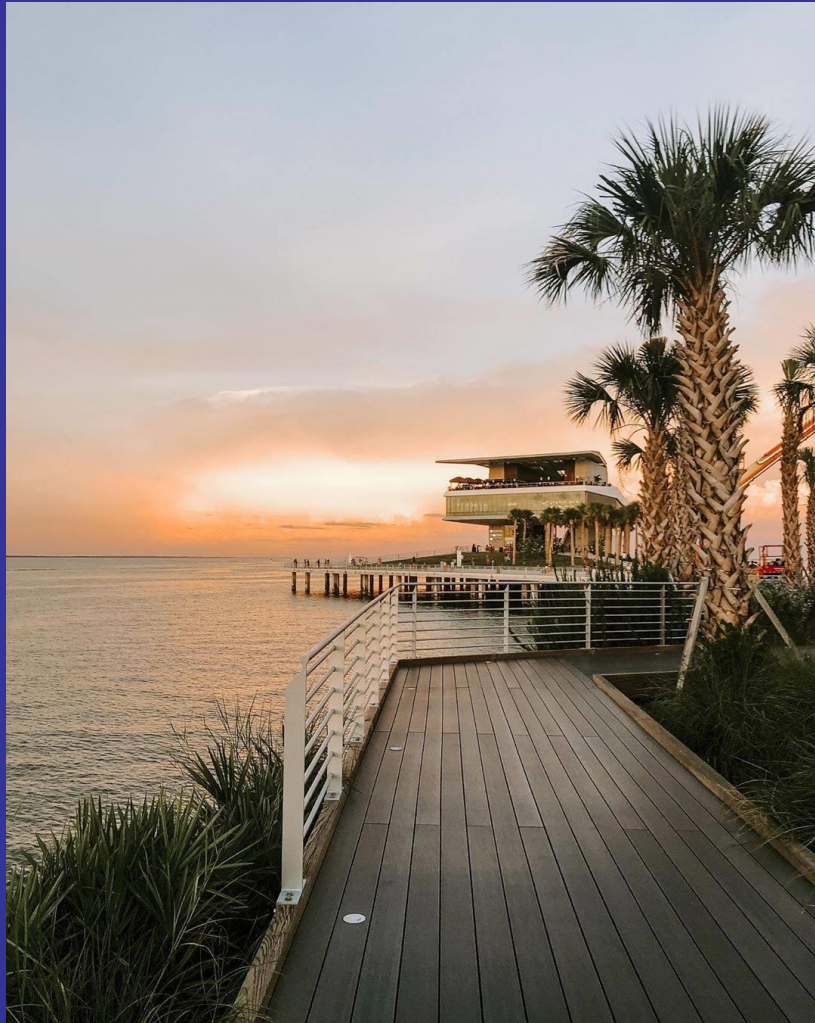
St. Petersburg Pier St. Petersburg, FL

Top 10 Urban Projects of the Americas 2022