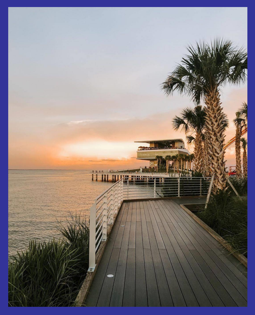
St. Petersburg Pier St. Petersburg, FL

Top 10 Urban Projects of the Americas 2022 Urban Land Institute