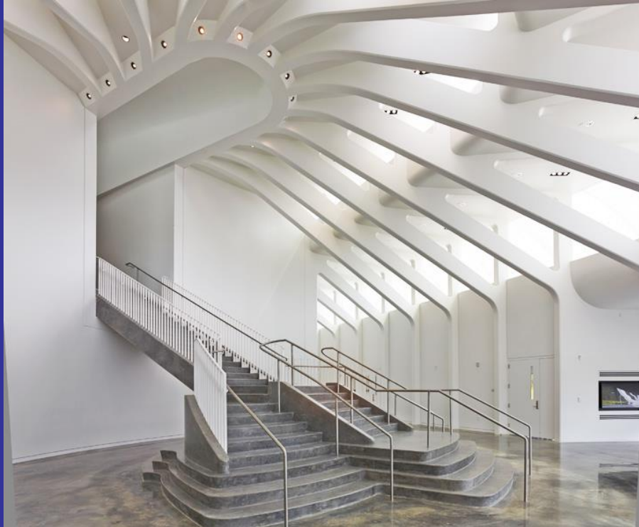
Florida Polytechnic University Lakeland , FL

Engineering News Records Global Project of the Year 2015